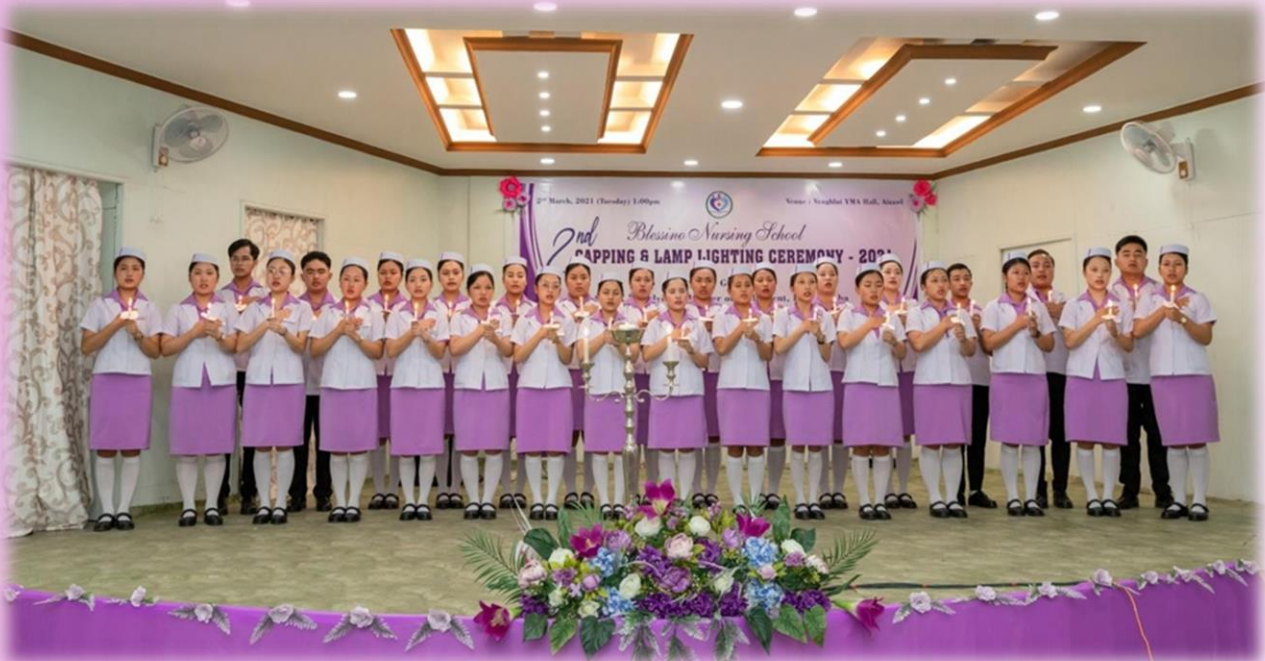
2 nd CAPPING 2021