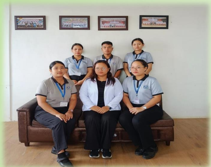
ENF Elected OB 2023-2024 with adviser