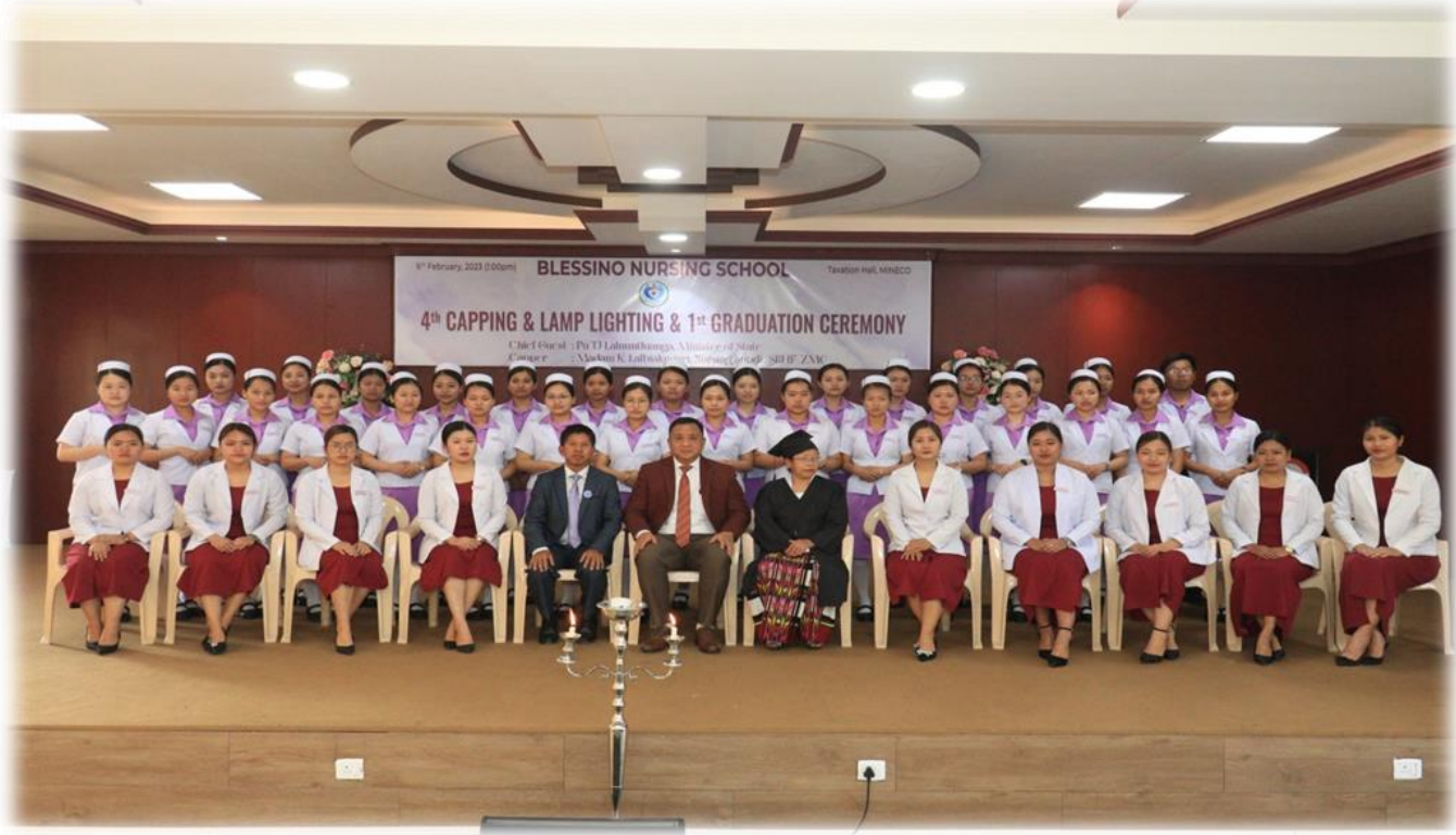
4 th CAPPING 2023