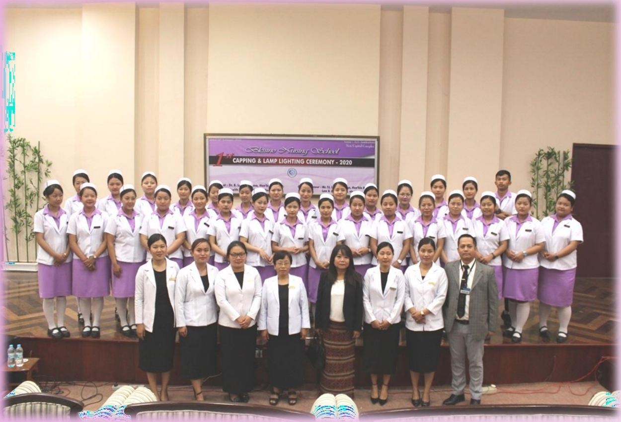
1 st CAPPING 2020