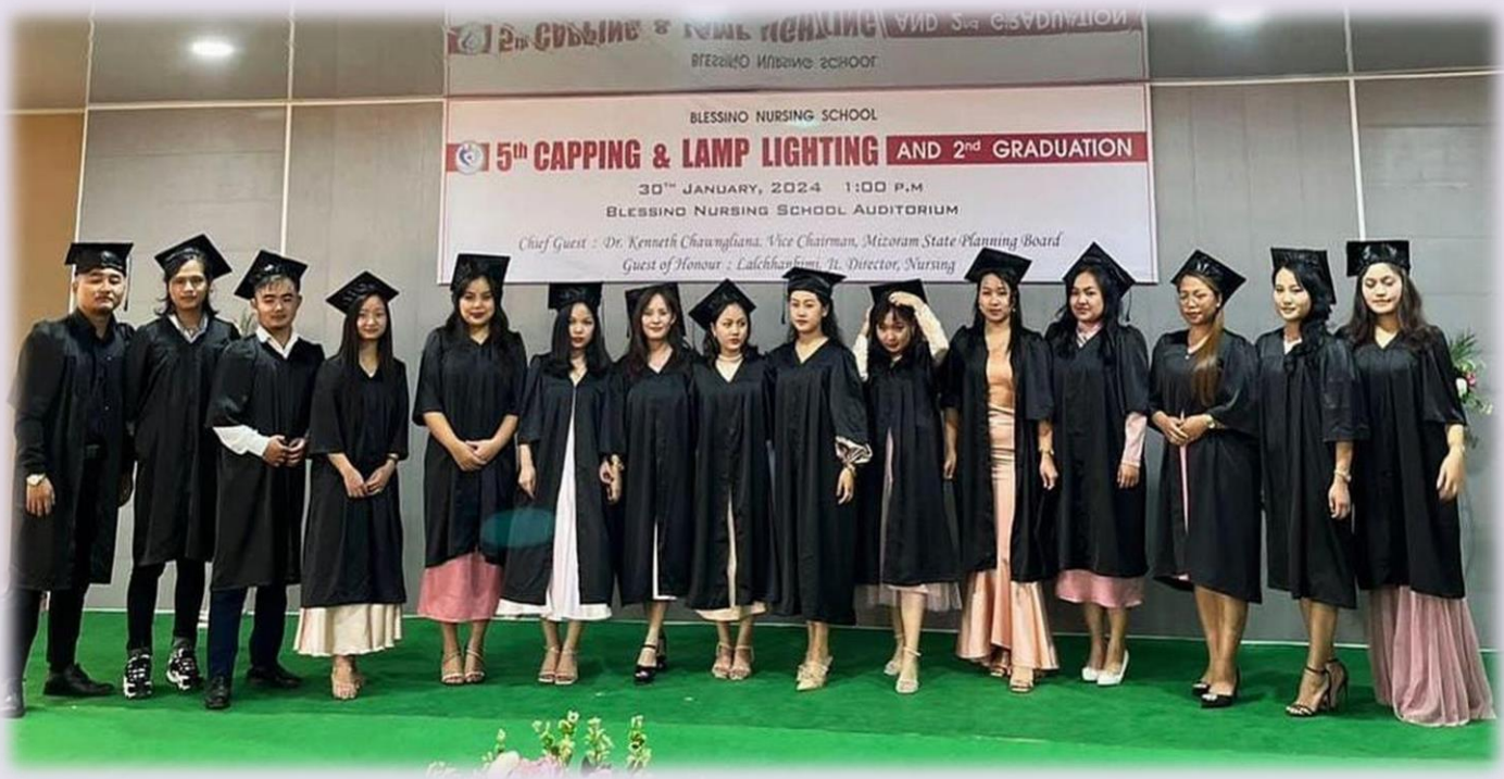
2nd Graduation 2024