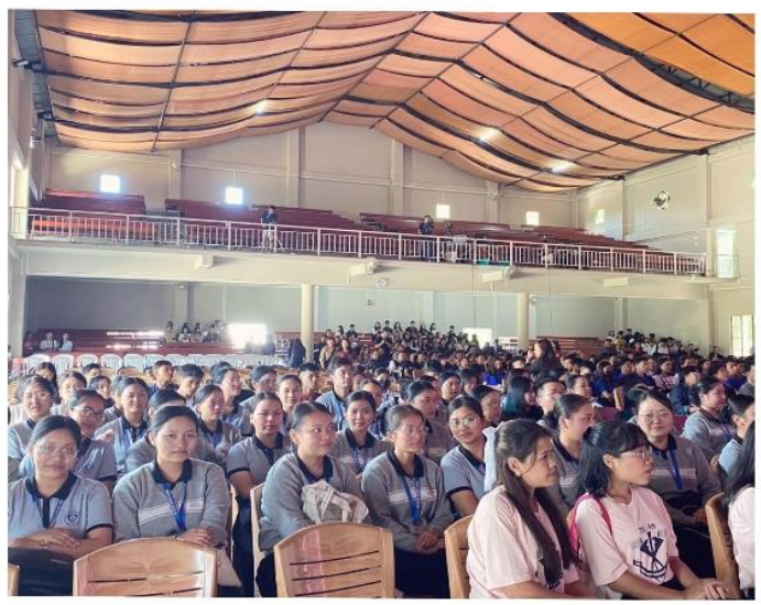
RED RIBBON CLUB REELS MAKING COMPETITION 1 st Prize