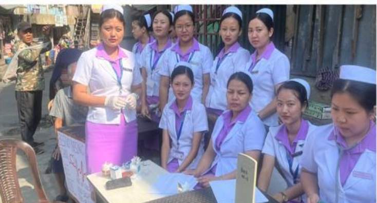
Blood Donation & Free Clinic