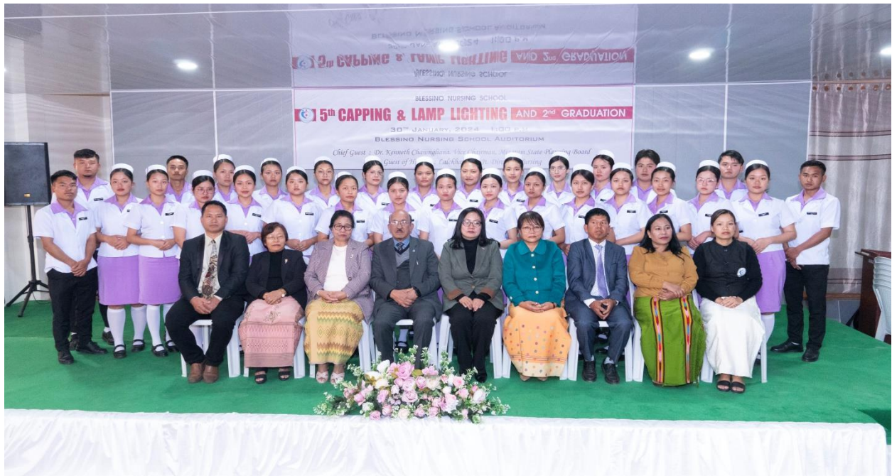
5th CAPPING 2024