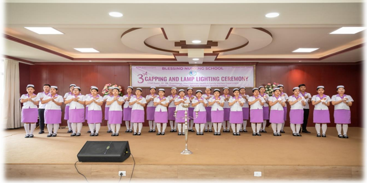
3 rd CAPPING 2022