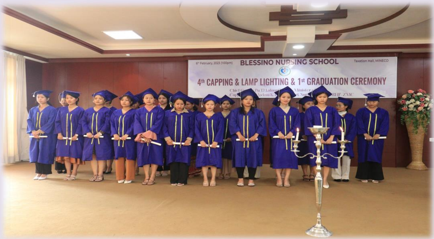
1st Graduation 2023