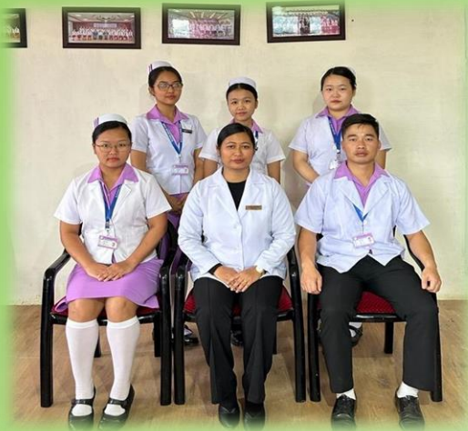
SNA Elected OB 2023-2024 with adviser